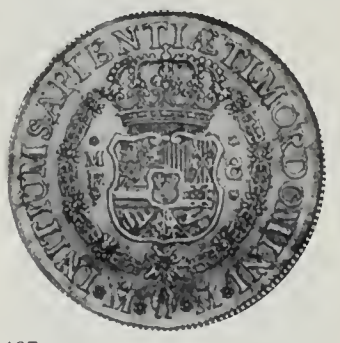
Lot No. 2467

8 Escudos, 1743 Mo-MF. Type as above. C-T 172, KM 148. Somewhat weakly struck in the centers and a few faint adjustment marks showing on the obverse. Considerable field lustre remaining. Almost Extremely Fine with an attractive tone. (2,500–2,750)